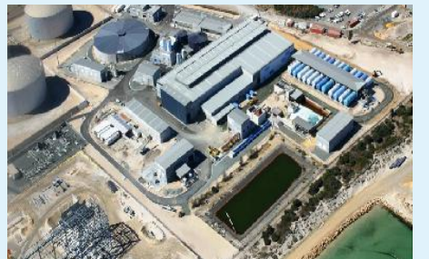
Perth Desalination Plant (Australia)

*En fabricación / Manufacturing Process / Dans la fabrication Actualizado / Updated 13.03.19