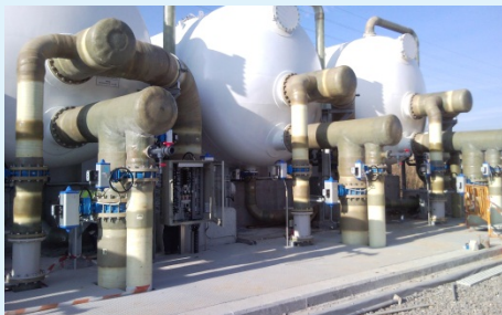
Delta de la Tordera Desalination Plant (Spain)