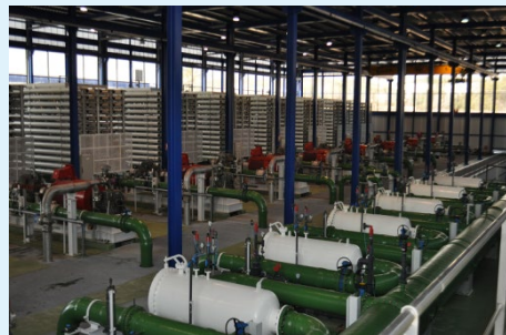
Alicante I Desalination Plant (Spain)