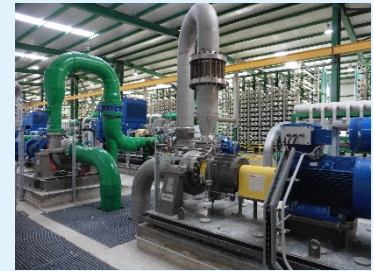
Jorf Lasfar Desalination Plant (Morocco)