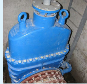
Vodokanal Moscow (Russia)