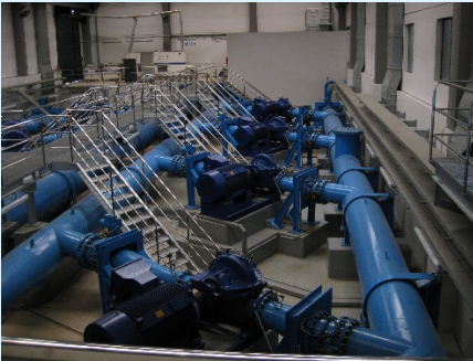
Aigües Segarra Garrigues (Spain)