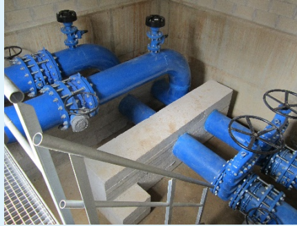
Valles Alavese-Red en Alta del Regadío (Spain)