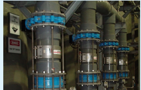
Ulu Pandan NeWater plant (Singapore)