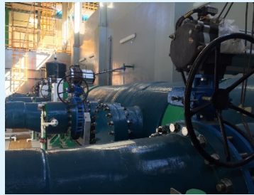
AAI Zawrah Dubai Desal Plant (UAE)