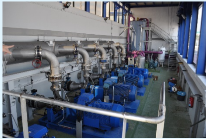
Desaladora San Pedro del Pinatar (Spain)