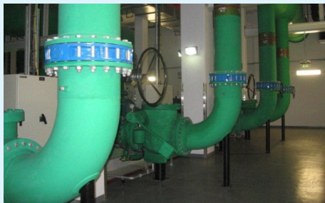
Burj Khalifa District Cooling DCP3 (Dubai)