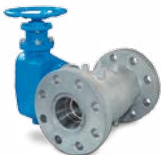
The alpine hydro-electric power plant Kopswerk II in Austria was equipped with needle valves of the extreme pressure rating PN 160.